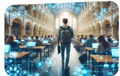
△ Photoillustrations created with AI