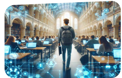
△ Photoillustrations created with AI